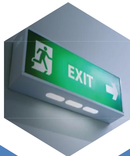
Emergency Lighting Honeywell, Teknoware, Cooper

We supply the full range of data and fiber optic cables meeting the various project requirements and specifications.