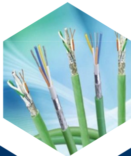
Data Cables Belden, B3

Our team of qualified electricians can take various types of jobs including medium voltage, low voltage, lighting, BMS and all other low current systems – both for new and retrofit projects.