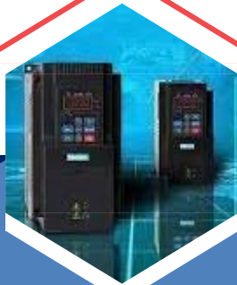
VFD & Soft Starters Honeywell, Danfoss, Allen Bradley

From small to mega projects, we cover wide range of electrical products and customized solutions with our range of world class suppliers and solutions. Our experts can work with you to define your exact requirements and then propose a solution that is both competitive in price and meet the technical requirements of your project.