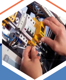
Control Panels Schneider Electric, ABB

VFD's - Variable Frequency Drives control the speed of fans and pumps thus providing the opportunity to maximize energy savings. We supply VFD's along with panels, installation, programming & commissioning services.