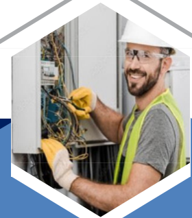
Installation Electrical, BMS, Low Current

Our strength in BMS, VFD's and MCC gives you peace of mind for getting the complete solution of HVAC controls from a single source. You also avoid the hassle of coordination between different equipment suppliers.