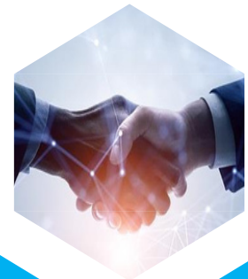
And much more . . . As per your project requirements

Our best-in-class emergency lighting product range covers exit lights, emergency lights, central battery systems, emergency lighting monitoring systems and central monitoring systems.