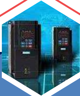
VFD & Soft Starters Honeywell, Danfoss, Allen Bradley

From small to mega projects, we cover wide range of electrical products and customized solutions with our range of world class suppliers and solutions. Our experts can work with you to define your exact requirements and then propose a solution that is both competitive in price and meet the technical requirements of your project.