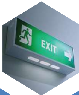
Emergency Lighting Honeywell, Teknoware, Cooper

We supply the full range of data and fiber optic cables meeting the various project requirements and specifications.