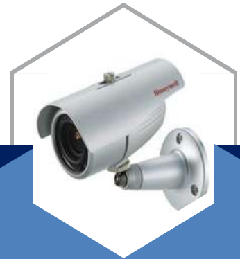
CCTV Honeywell HikVision, Hanwa

VESDA detectors have multi-level warnings and a wide range of sensitivity that does not degrade or change over time, so even minute levels of smoke can be detected before a fire has time to escalate.