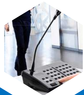
Public Address Honeywell TOA, Bosch

This system recognizes unauthorized individuals or objects entering a prohibited area. A single camera solution or an integrated solution is used to establish control.