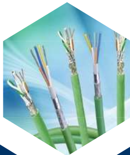
Data Cables Belden, B3

Our team of qualified electricians can take various types of jobs including medium voltage, low voltage, lighting, BMS and all other low current systems – both for new and retrofit projects.