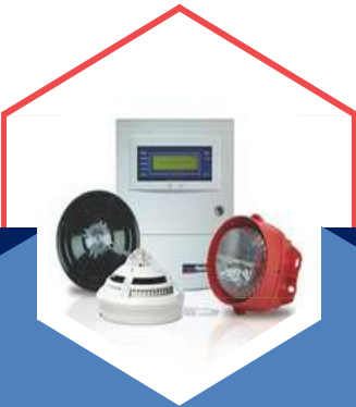
Fire Alarm Honeywell Hochiki

We at Aala Tech are extremely concerned about your safety. With some of the best systems in the world and an experienced team, we provide a safe and dependable solution that includes installation, long-term maintenance, and after-sales services.