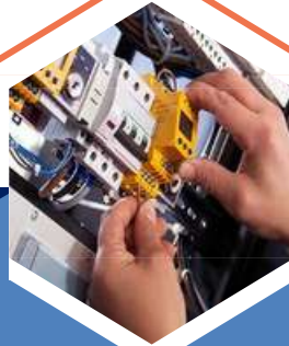
Control Panels Schneider Electric, ABB

VFD's - Variable Frequency Drives control the speed of fans and pumps thus providing the opportunity to maximize energy savings. We supply VFD's along with panels, installation, programming & commissioning services.