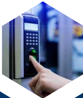
Access Control Honeywell HikVision

Exterior cameras, speed domes, water-proof infrared cameras, and high resolution cameras. We provide comprehensive CCTV systems from a number of top global brands.