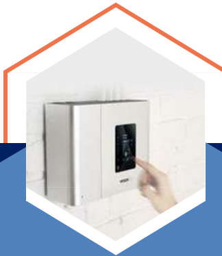
Vesda Very Early Smoke Detection Apparatus

From design, supply, installation, and commissioning to maintenance and after-sales services, we offer comprehensive solutions for all of your fire alarm system requirements.