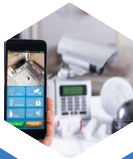
Intrusion Control Honeywell HikVision

We offer hardware and software solutions for locks, readers, controllers, and credentials used in access control. These systems are adaptable and appropriate for projects of all sizes.